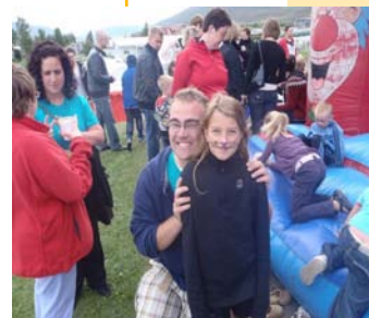
One of the girls from the first picture, hanging out with me the next day.