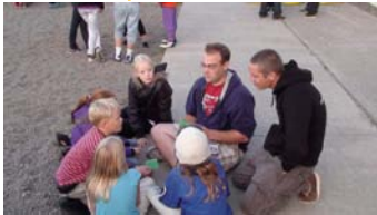
Sharing the Wordless Book with Icelandic kids.